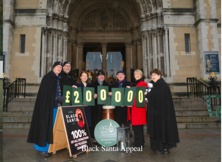
Black Santa Appeal