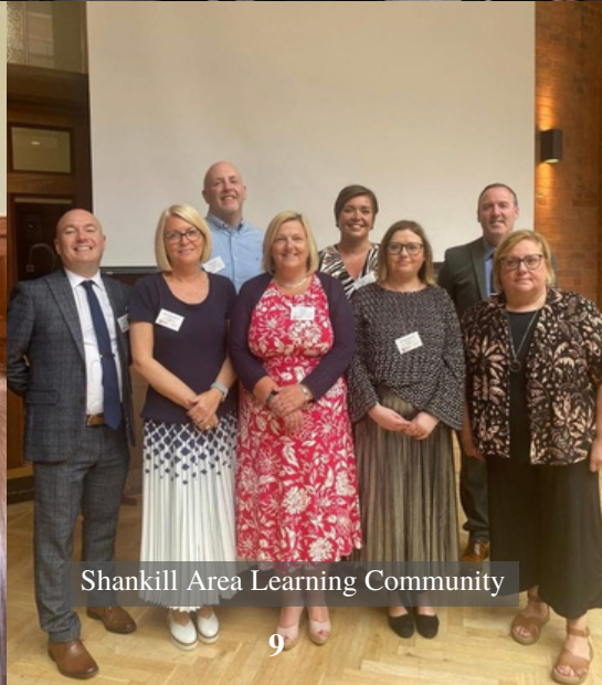
Shankill Area Learning Community