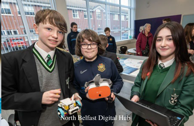
North Belfast Digital Hub