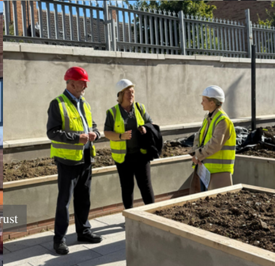
Ardoyne Bone Community Health & Leisure Trust