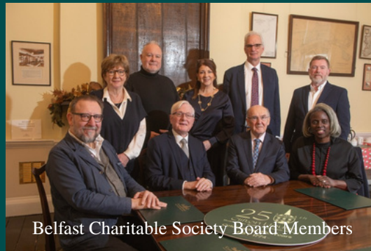
Belfast Charitable Society Board Members

Belfast Charitable Society is registered as a charity with HMRC (Charity Registration no XN45101). The charity registered with the Charity Commission for Northern Ireland on 25 April 2016 (NIC 104998). Its principal office and registered office is Clifton House, 2 North Queen Street, Belfast BT15 1ES.