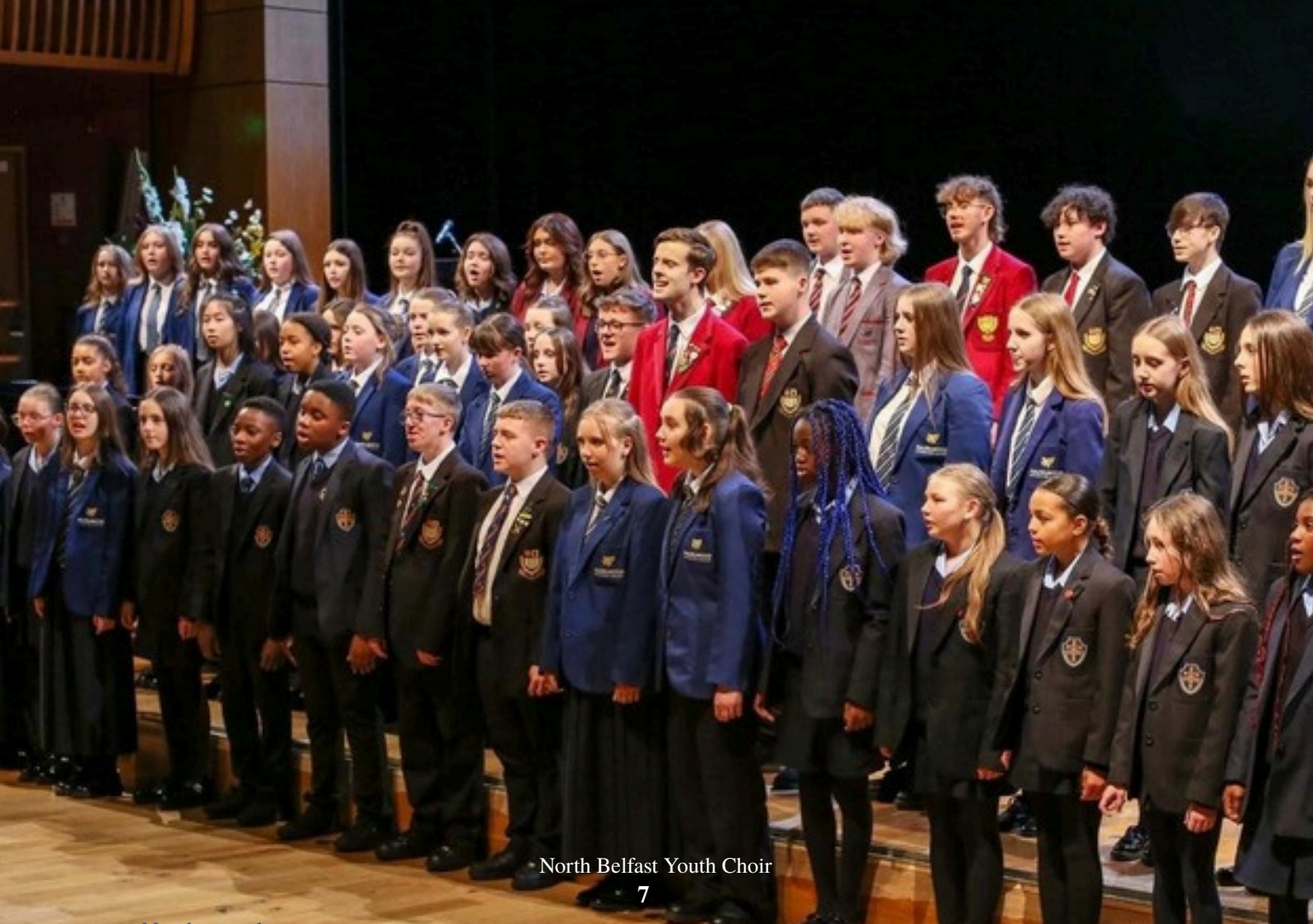
North Belfast Youth Choir