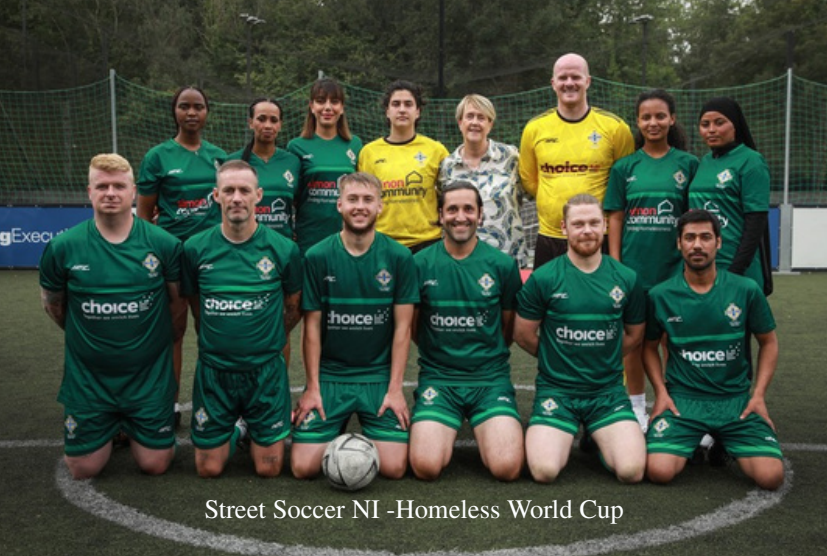
Street Soccer NI -Homeless World Cup