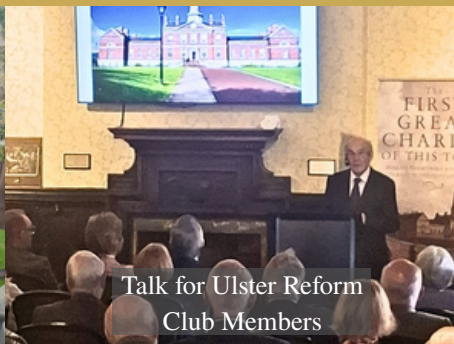
Talk for Ulster Reform Club Members