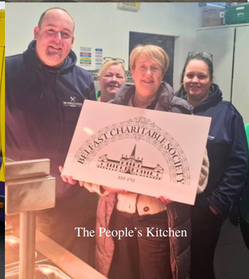
The People's Kitchen