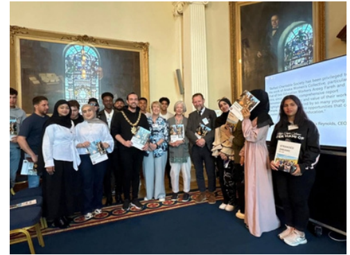
Launch of Stranded Dreams Report