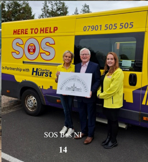
SOS Bus NI