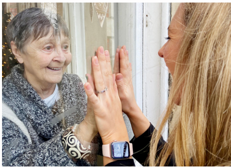
Benn Dinner 2021