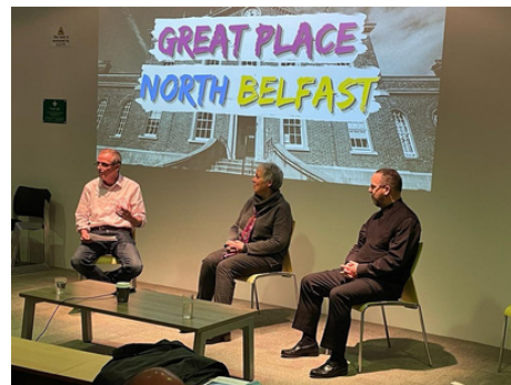
Heritage and Regeneration Festival Event