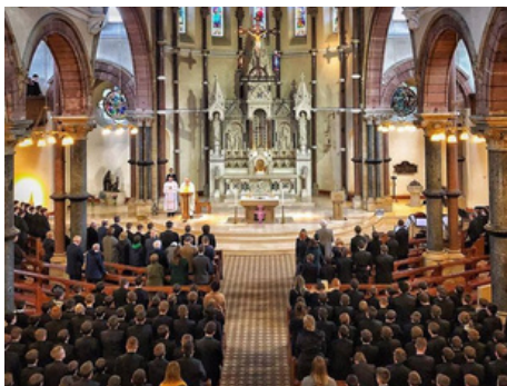
St Malachys College at St Patrick's Church