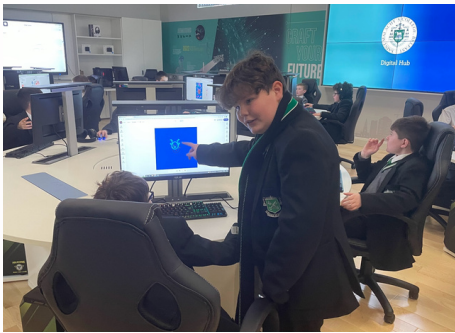
North Belfast Creative Digital Technology Hub