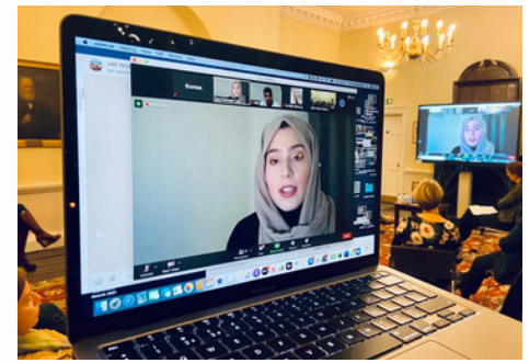
Women's Role in Society: The Experience in Afghanistan