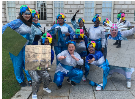
ANAKA Women's Collective