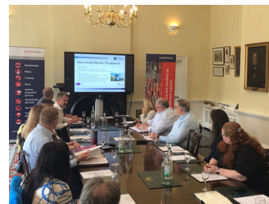
Logistics NI Freight Conference