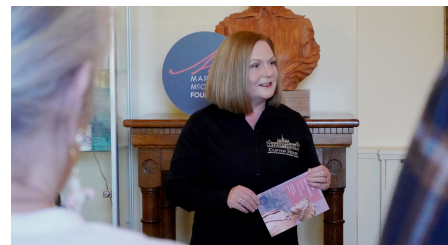
Mary Ann McCracken Tour