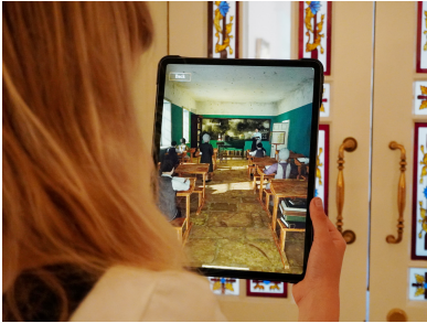
Augmented Reality Tour