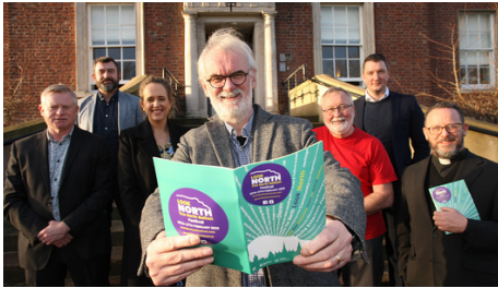
Launch of Look North! Festival