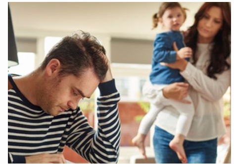
Cost of Living Crisis