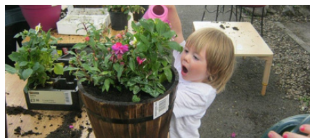
Barbour Fund Project