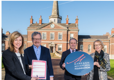
Mary Ann McCracken Post Primary Bursaries